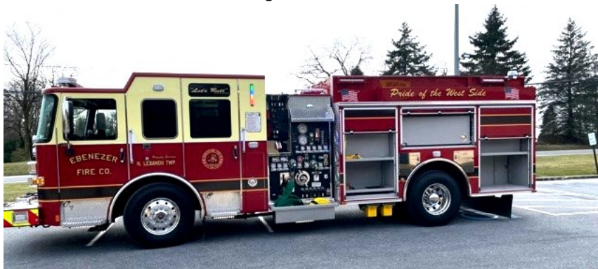
Congratulations to Ebenezer Fire Company on the purchase of a new fire engine!

VOLUNTEERS are appreciated & needed to help keep all of our parks beautiful!! Please contact the township office if you are interested in volunteering.